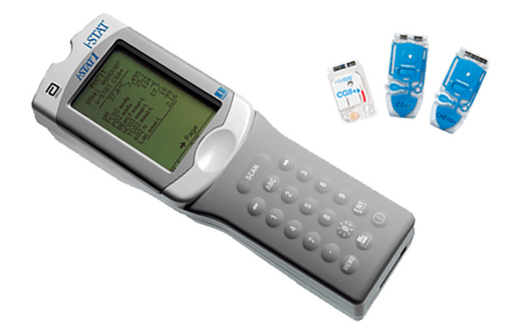
Figure 3. I-STAT with cartridges

As of writing, cartridges are available for the following blood measurements: