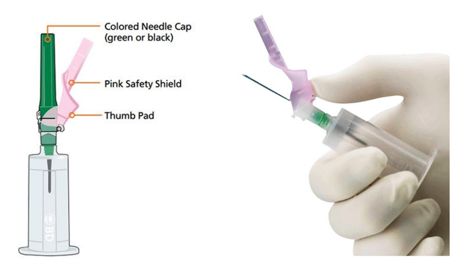
Figure 15-1. BD Vacutainer Eclipse Blood Collection Needle with Luer Adapter.

In principle, it is possible to secure the vacutainer needle to allow for intermittent blood samples, but during transport of a cryopatient team members may prefer to place an intravenous line. Blood samples can be drawn with a syringe, using a stopcock or directly from the line, and transferred to a blood collection tube. The disadvantage of this method is that the amount of blood and the speed at which the blood are drawn are not determined by the system. Another disadvantage, compared to the vacutainer system, is that such an "open system" can lead to spilling of blood during collection. Such events can be prevented by using a so-called "butterfly needle" which has flexible tubing attached to the small needle to connect a vacuum blood collection tube or syringe.