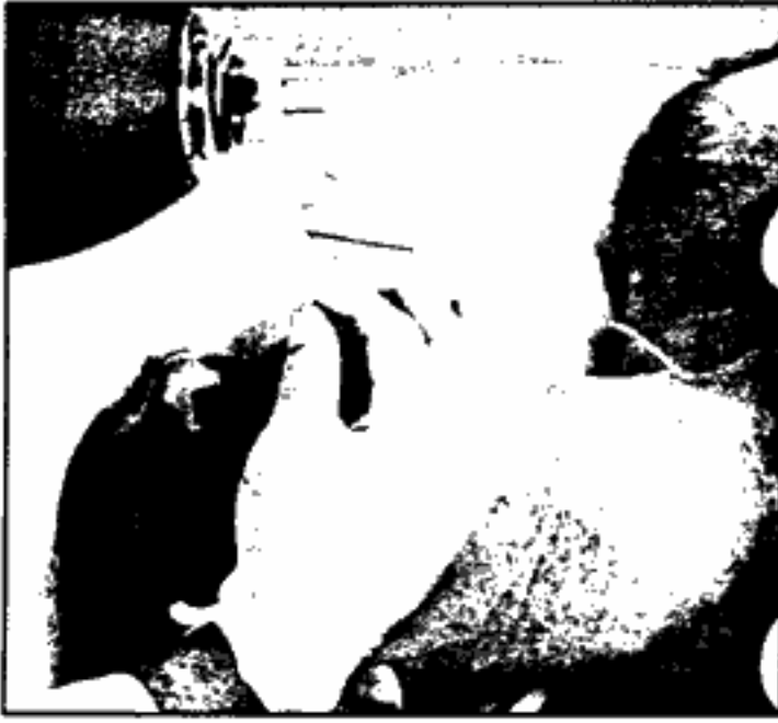
Figure 5-1. The FEF Detector in place between a bag-valve respirator and the patient's endotracheal tube.

Early in 1989, Fenem Airway Management System began marketing a simple, inexpensive device which uses a sensitive, rapidly responsive chemical indicator to evaluate the carbon dioxide concentration in a patient's expired air during resuscitation or intubation efforts. The FEF end-tidal \text{CO}_2 detector is a simple, disposable device which is interposed between the endotracheal tube and the bag-valve unit or the HLR respirator hose. A nontoxic chemical indicator strip displayed beneath a transparent dome on the device detects \text{CO}_2 concentration with each breath. The device can measure \text{CO}_2 concentrations from 0.03% to 5% using three separate indicator strips.